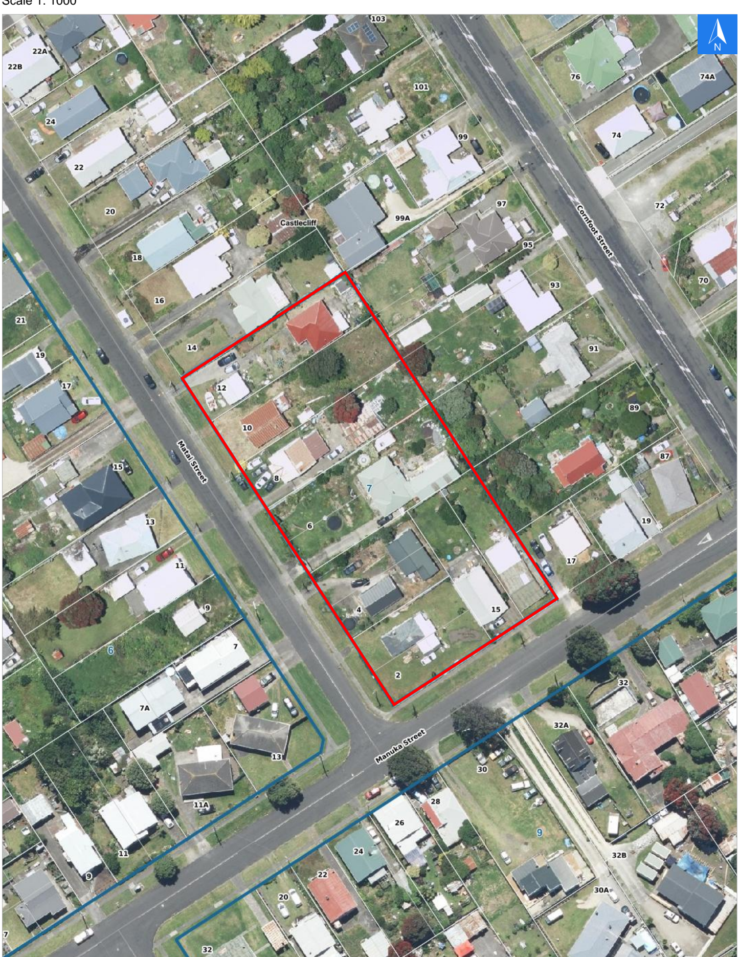
Scale 1: 1000

Digital map data sourced from Land Information New Zealand CROWN COPYRIGHT RESERVED. The information displayed in the GIS has been taken from Whanganui District Council's databases and maps. It is made available in good faith but its accuracy or completeness is not guaranteed. If the information is relied on in support of a resource consent it should be verified independently.