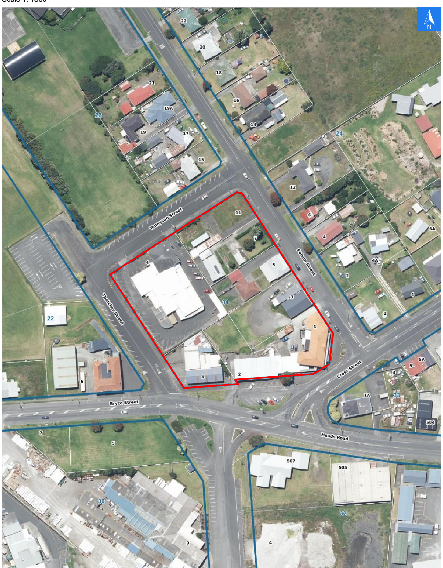
Scale 1: 1500

Digital map data sourced from Land Information New Zealand CROWN COPYRIGHT RESERVED. The information displayed in the GIS has been taken from Whanganui District Council's databases and maps. It is made available in good faith but its accuracy or completeness is not guaranteed. If the information is relied on in support of a resource consent it should be verified independently.