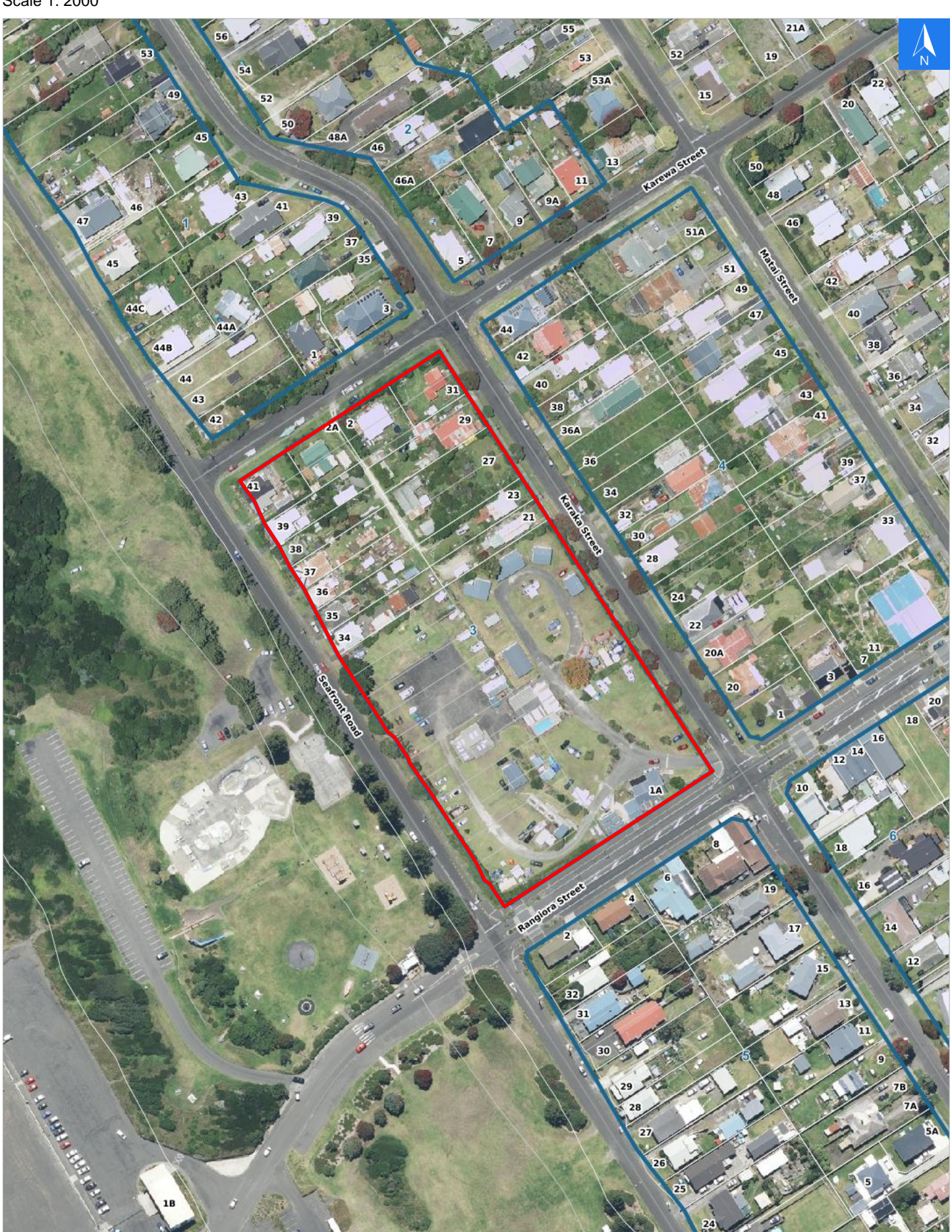
Scale 1: 2000

Digital map data sourced from Land Information New Zealand CROWN COPYRIGHT RESERVED. The information displayed in the GIS has been taken from Whanganui District Council's databases and maps. It is made available in good faith but its accuracy or completeness is not guaranteed. If the information is relied on in support of a resource consent it should be verified independently.