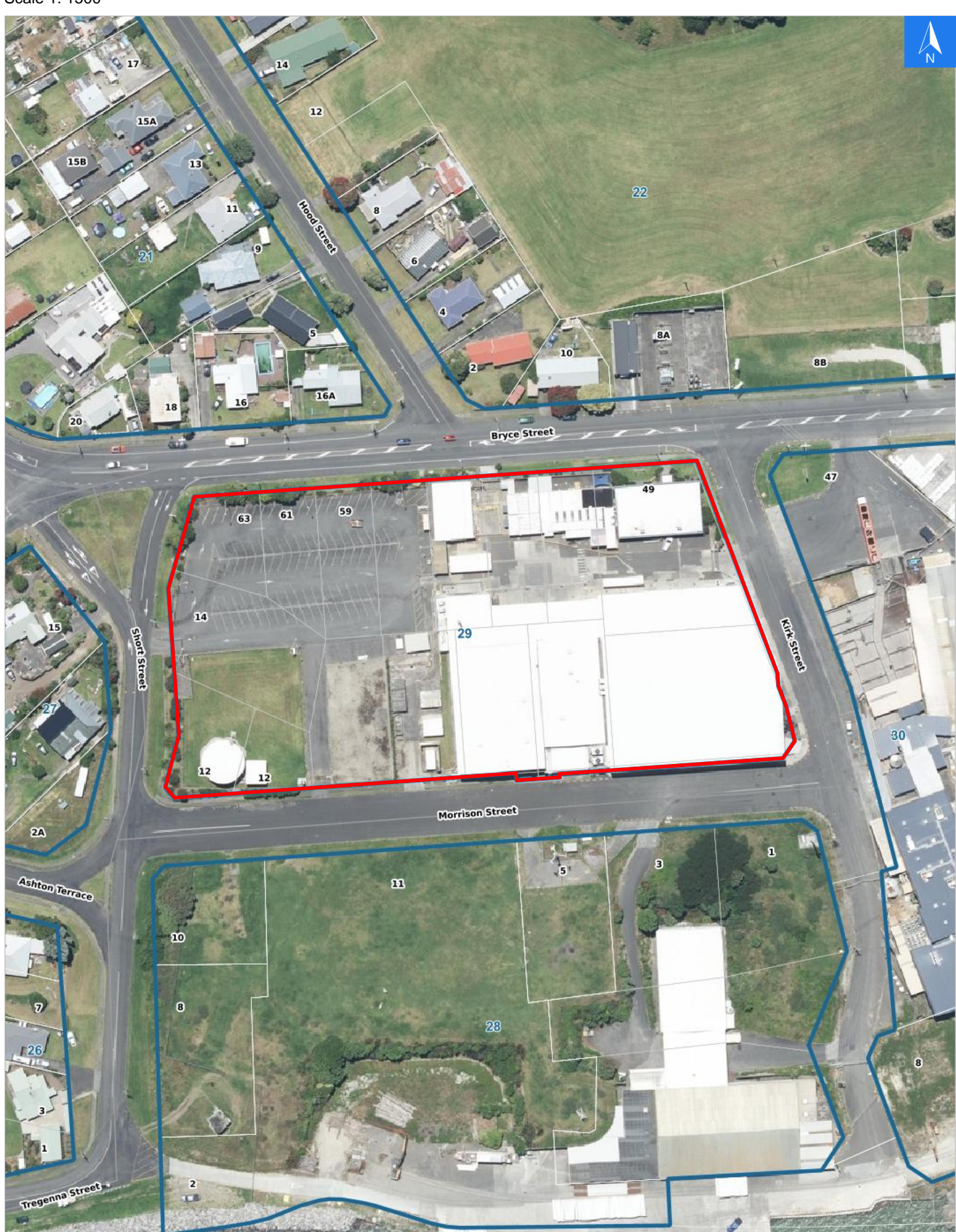
Scale 1: 1500

Digital map data sourced from Land Information New Zealand CROWN COPYRIGHT RESERVED. The information displayed in the GIS has been taken from Whanganui District Council's databases and maps. It is made available in good faith but its accuracy or completeness is not guaranteed. If the information is relied on in support of a resource consent it should be verified independently.