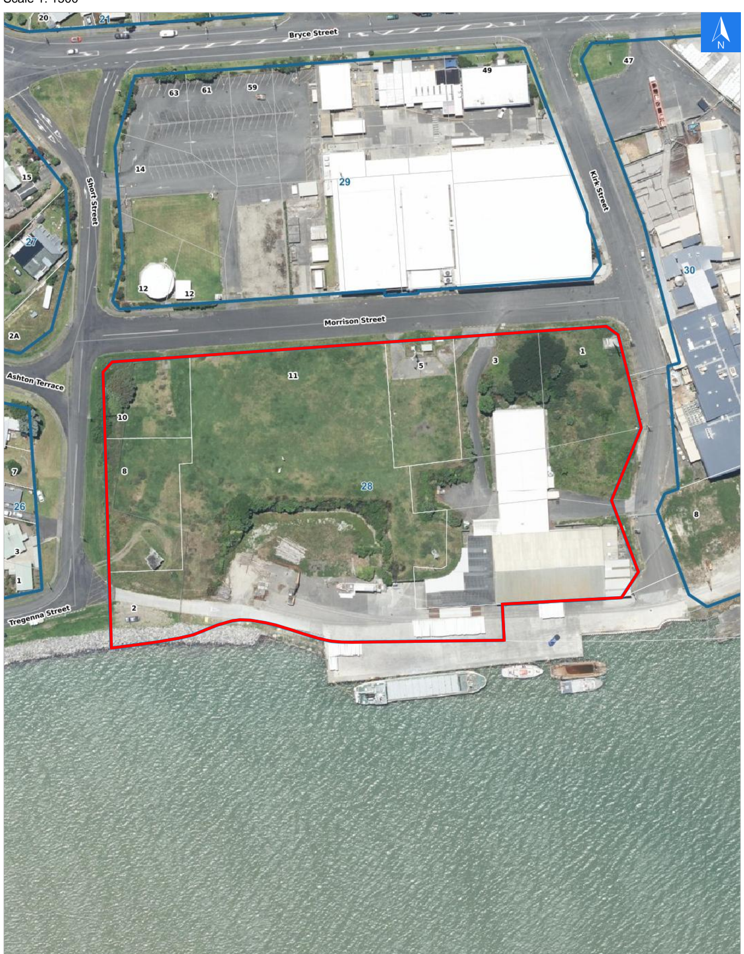
Scale 1: 1500

Digital map data sourced from Land Information New Zealand CROWN COPYRIGHT RESERVED. The information displayed in the GIS has been taken from Whanganui District Council's databases and maps. It is made available in good faith but its accuracy or completeness is not guaranteed. If the information is relied on in support of a resource consent it should be verified independently.