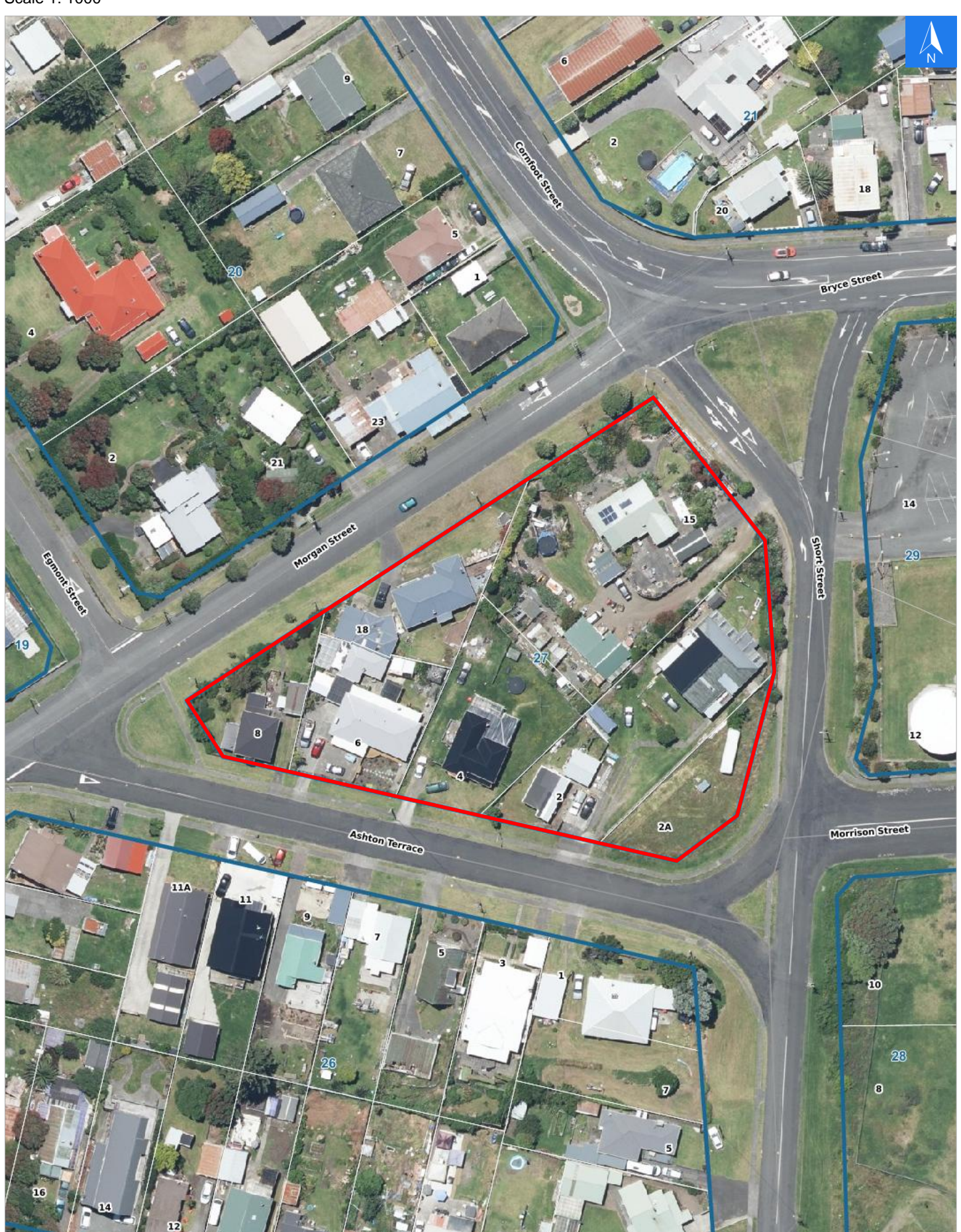
Scale 1: 1000

Digital map data sourced from Land Information New Zealand CROWN COPYRIGHT RESERVED. The information displayed in the GIS has been taken from Whanganui District Council's databases and maps. It is made available in good faith but its accuracy or completeness is not guaranteed. If the information is relied on in support of a resource consent it should be verified independently.