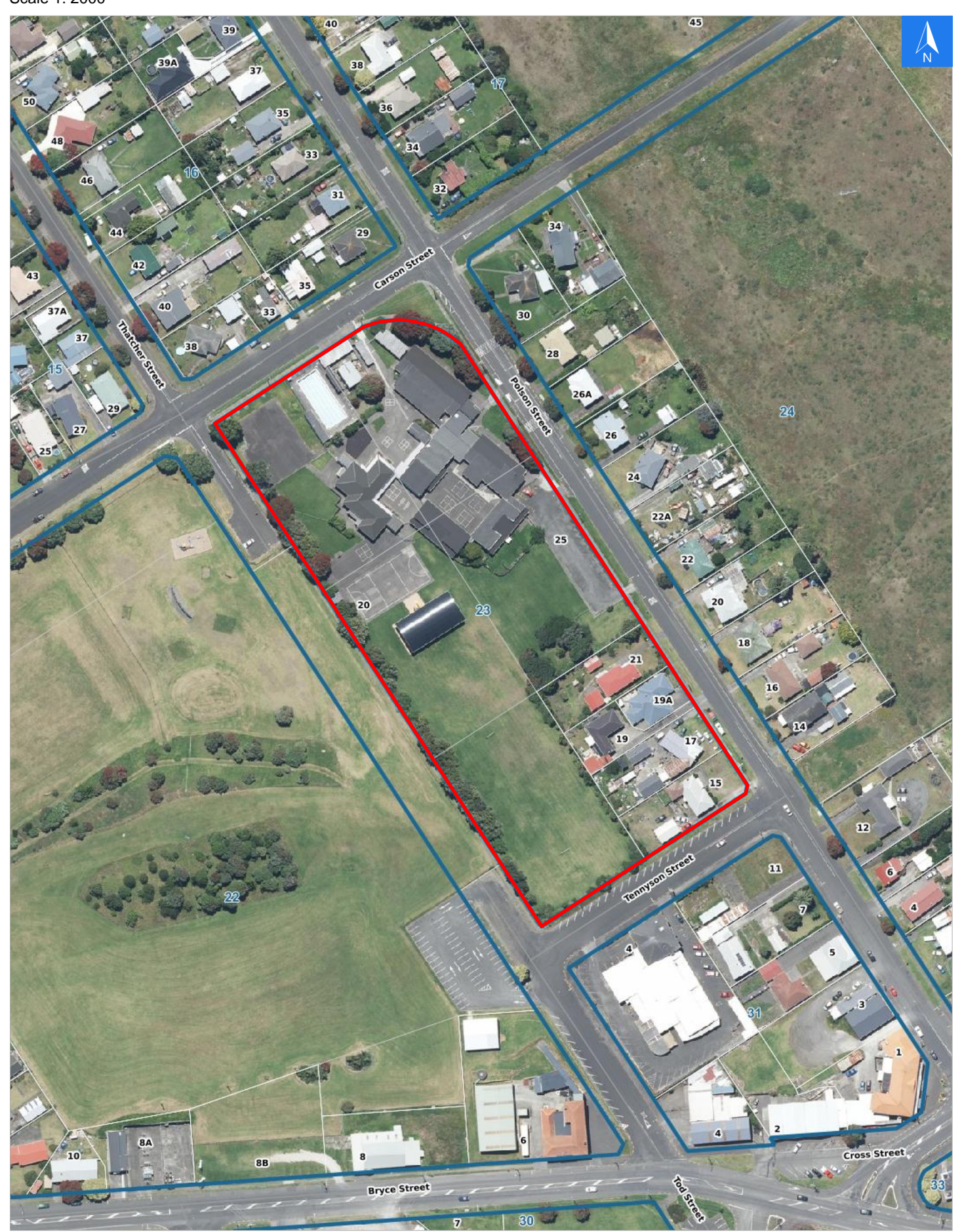
Scale 1: 2000

Digital map data sourced from Land Information New Zealand CROWN COPYRIGHT RESERVED. The information displayed in the GIS has been taken from Whanganui District Council's databases and maps. It is made available in good faith but its accuracy or completeness is not guaranteed. If the information is relied on in support of a resource consent it should be verified independently.