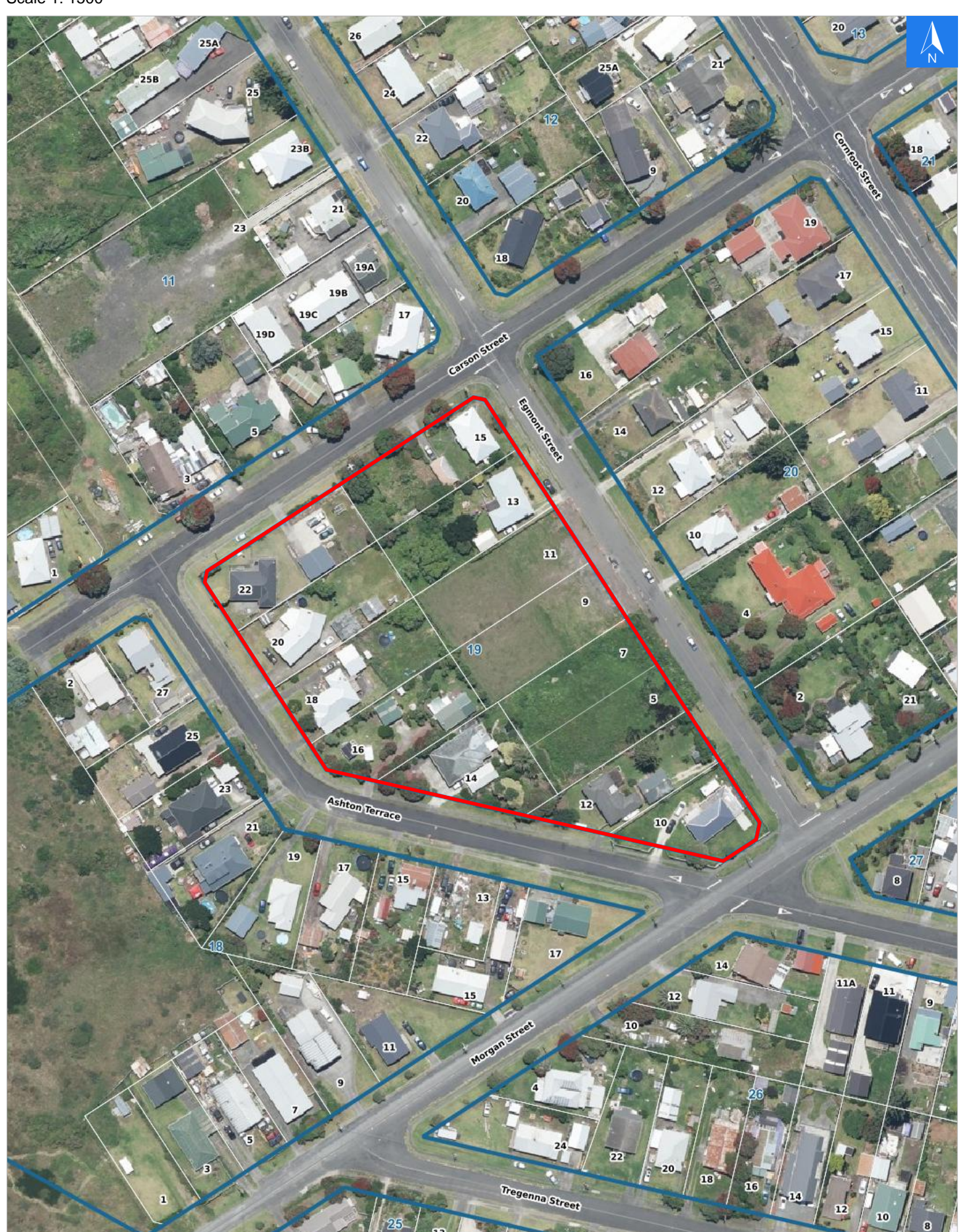
Scale 1: 1500

Digital map data sourced from Land Information New Zealand CROWN COPYRIGHT RESERVED. The information displayed in the GIS has been taken from Whanganui District Council's databases and maps. It is made available in good faith but its accuracy or completeness is not guaranteed. If the information is relied on in support of a resource consent it should be verified independently.