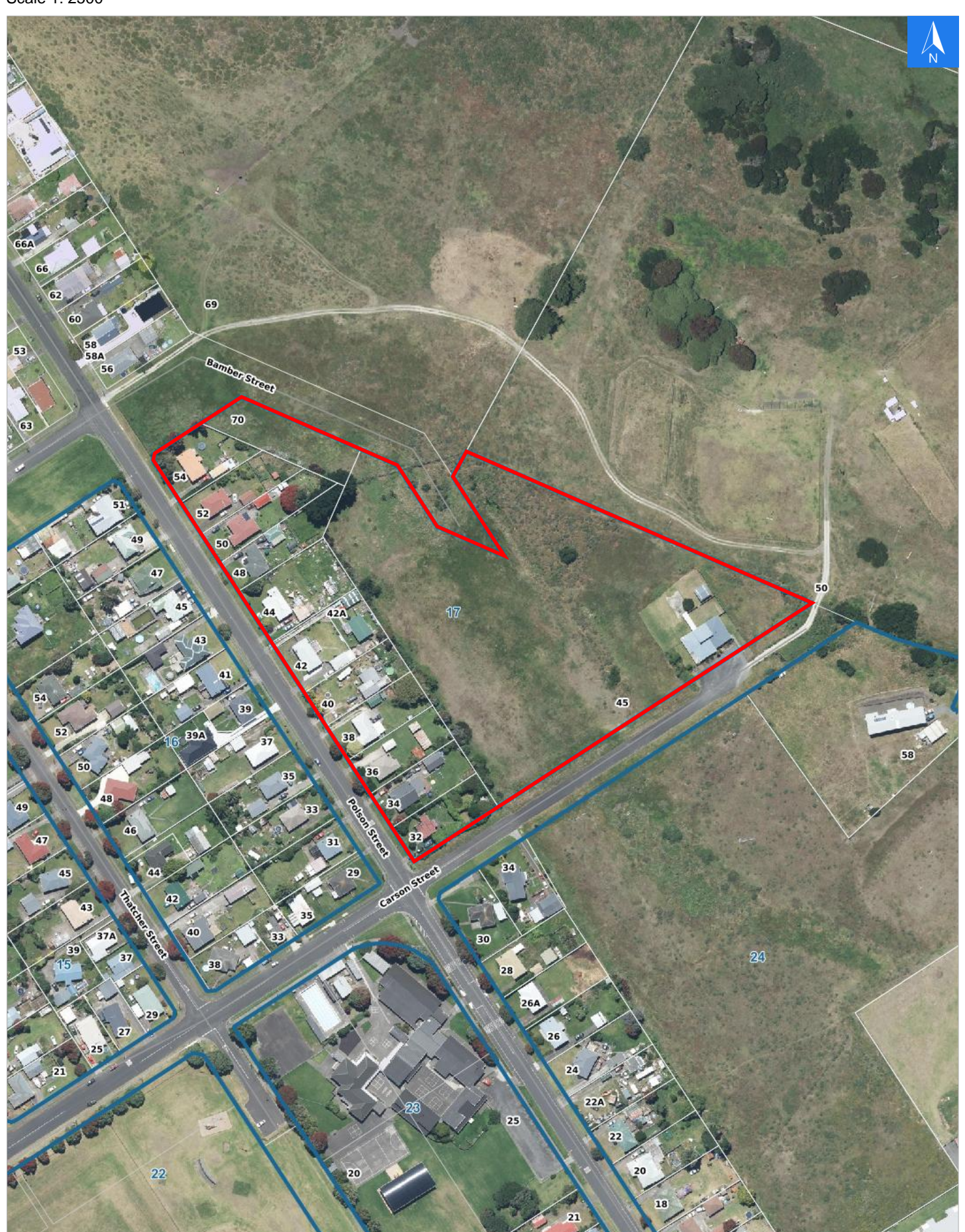
Scale 1: 2500

Digital map data sourced from Land Information New Zealand CROWN COPYRIGHT RESERVED. The information displayed in the GIS has been taken from Whanganui District Council's databases and maps. It is made available in good faith but its accuracy or completeness is not guaranteed. If the information is relied on in support of a resource consent it should be verified independently.