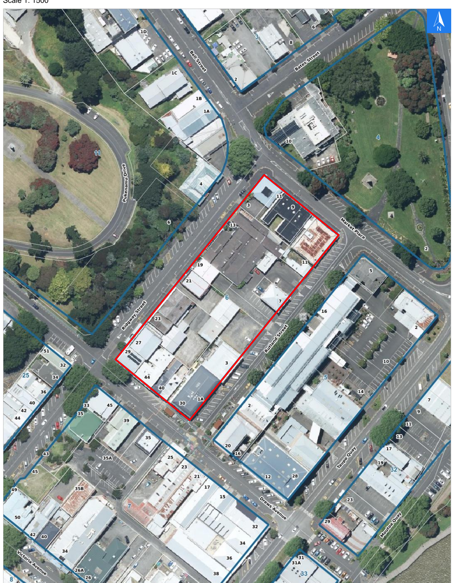
Scale 1: 1500

Digital map data sourced from Land Information New Zealand CROWN COPYRIGHT RESERVED. The information displayed in the GIS has been taken from Whanganui District Council's databases and maps. It is made available in good faith but its accuracy or completeness is not guaranteed. If the information is relied on in support of a resource consent it should be verified independently.