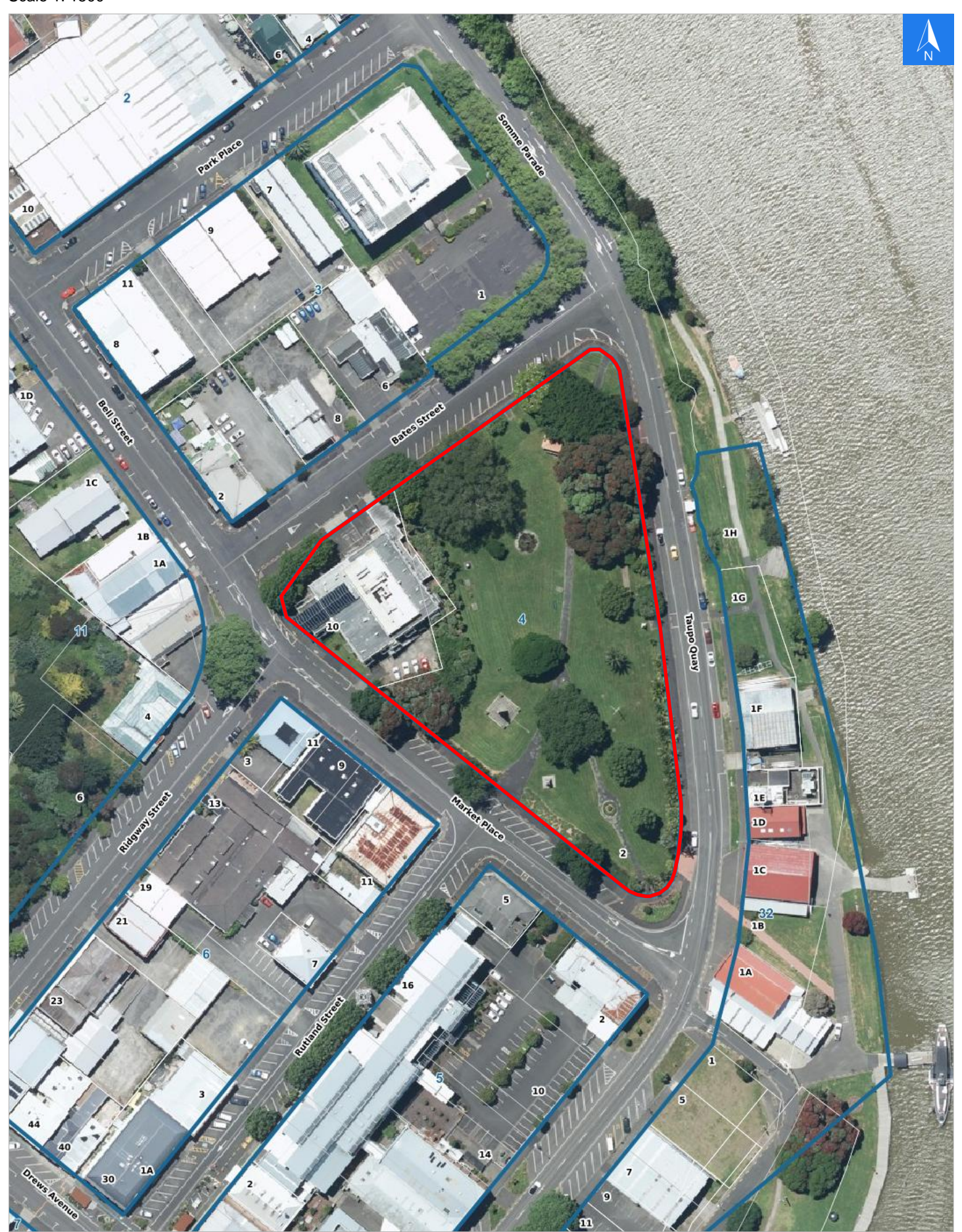
Scale 1: 1500

Digital map data sourced from Land Information New Zealand CROWN COPYRIGHT RESERVED. The information displayed in the GIS has been taken from Whanganui District Council's databases and maps. It is made available in good faith but its accuracy or completeness is not guaranteed. If the information is relied on in support of a resource consent it should be verified independently.