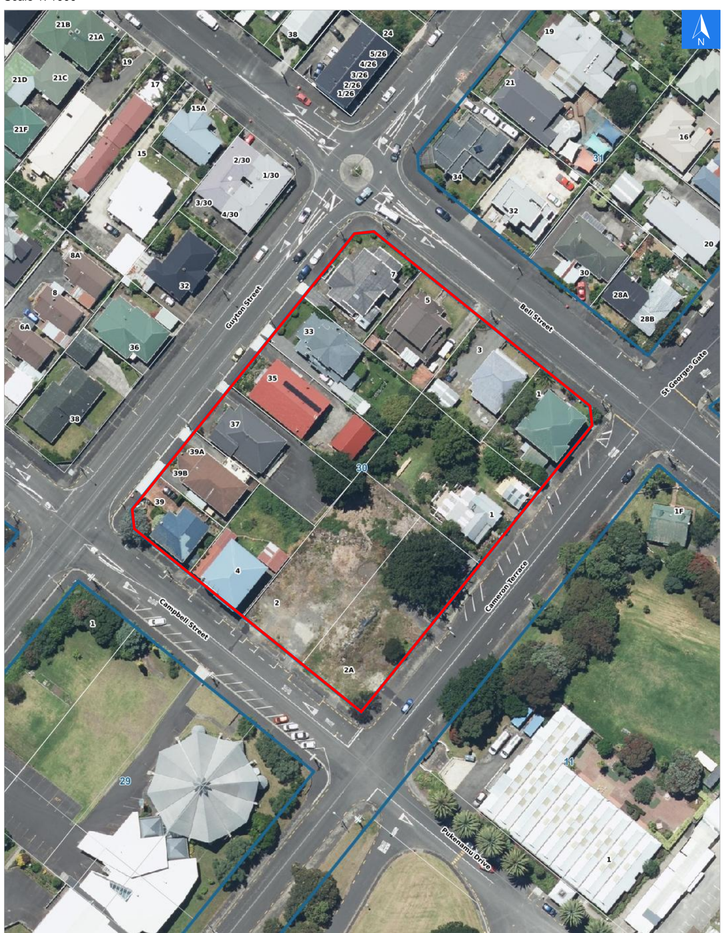
Scale 1: 1000

Digital map data sourced from Land Information New Zealand CROWN COPYRIGHT RESERVED. The information displayed in the GIS has been taken from Whanganui District Council's databases and maps. It is made available in good faith but its accuracy or completeness is not guaranteed. If the information is relied on in support of a resource consent it should be verified independently.