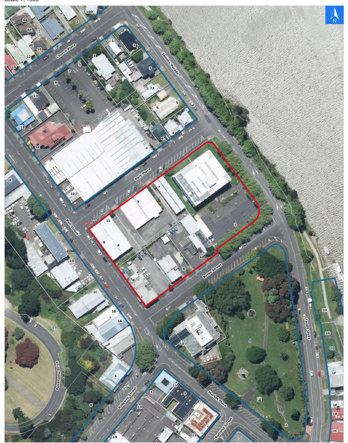
Scale 1: 1500

Digital map data sourced from Land Information New Zealand CROWN COPYRIGHT RESERVED. The information displayed in the GIS has been taken from Whanganui District Council's databases and maps. It is made available in good faith but its accuracy or completeness is not guaranteed. If the information is relied on in support of a resource consent it should be verified independently.