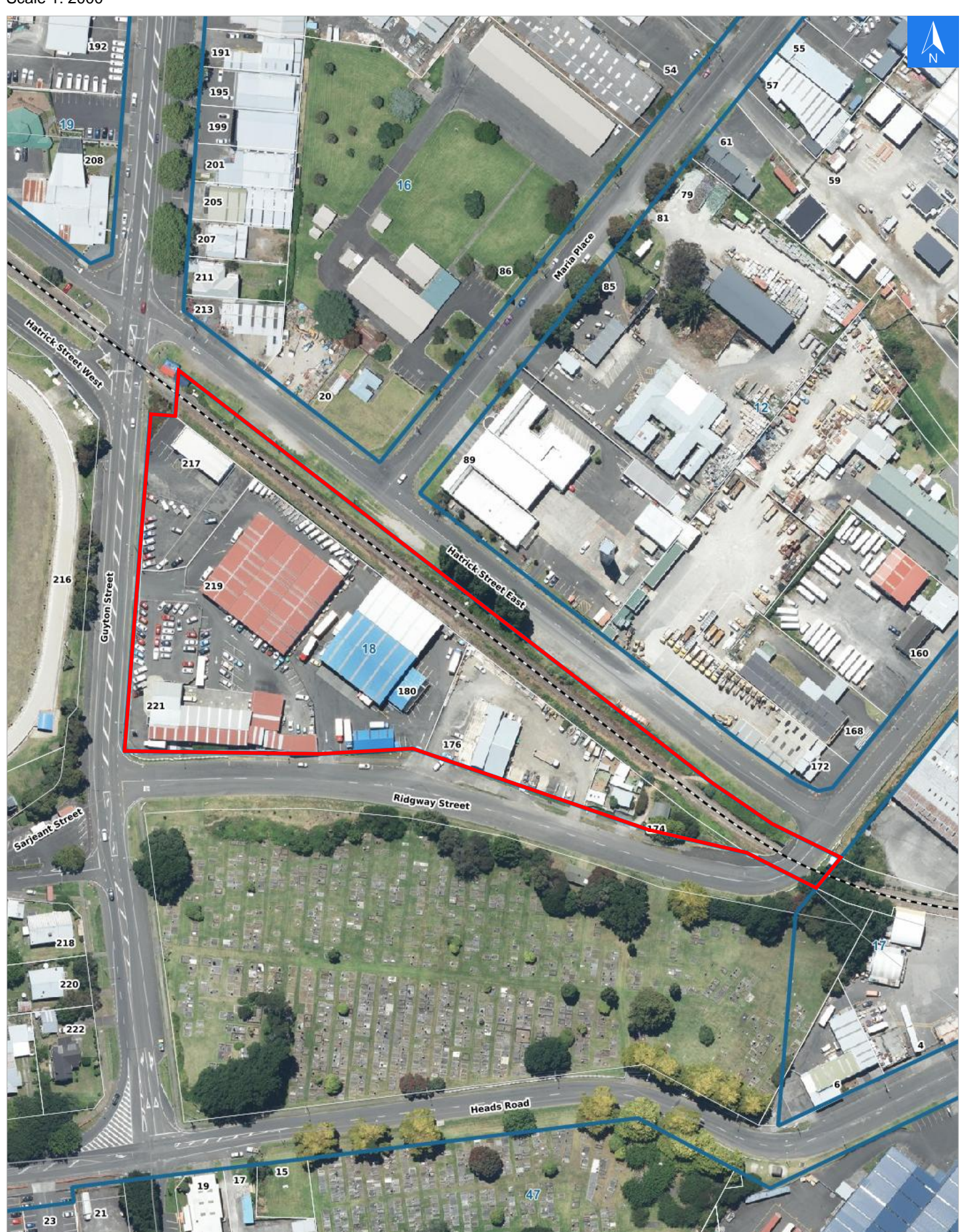
Scale 1: 2000

Digital map data sourced from Land Information New Zealand CROWN COPYRIGHT RESERVED. The information displayed in the GIS has been taken from Whanganui District Council's databases and maps. It is made available in good faith but its accuracy or completeness is not guaranteed. If the information is relied on in support of a resource consent it should be verified independently.