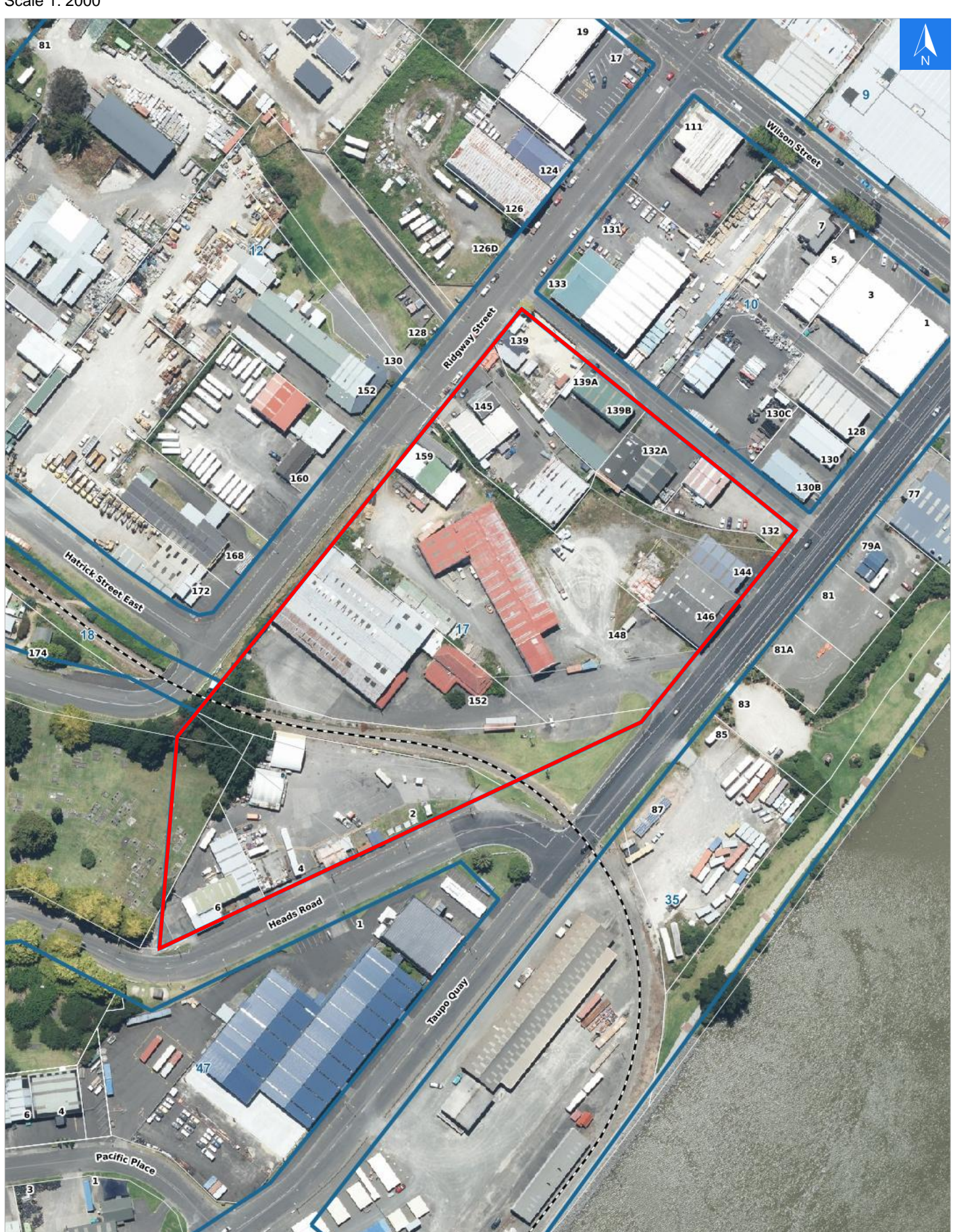
Scale 1: 2000

Digital map data sourced from Land Information New Zealand CROWN COPYRIGHT RESERVED. The information displayed in the GIS has been taken from Whanganui District Council's databases and maps. It is made available in good faith but its accuracy or completeness is not guaranteed. If the information is relied on in support of a resource consent it should be verified independently.