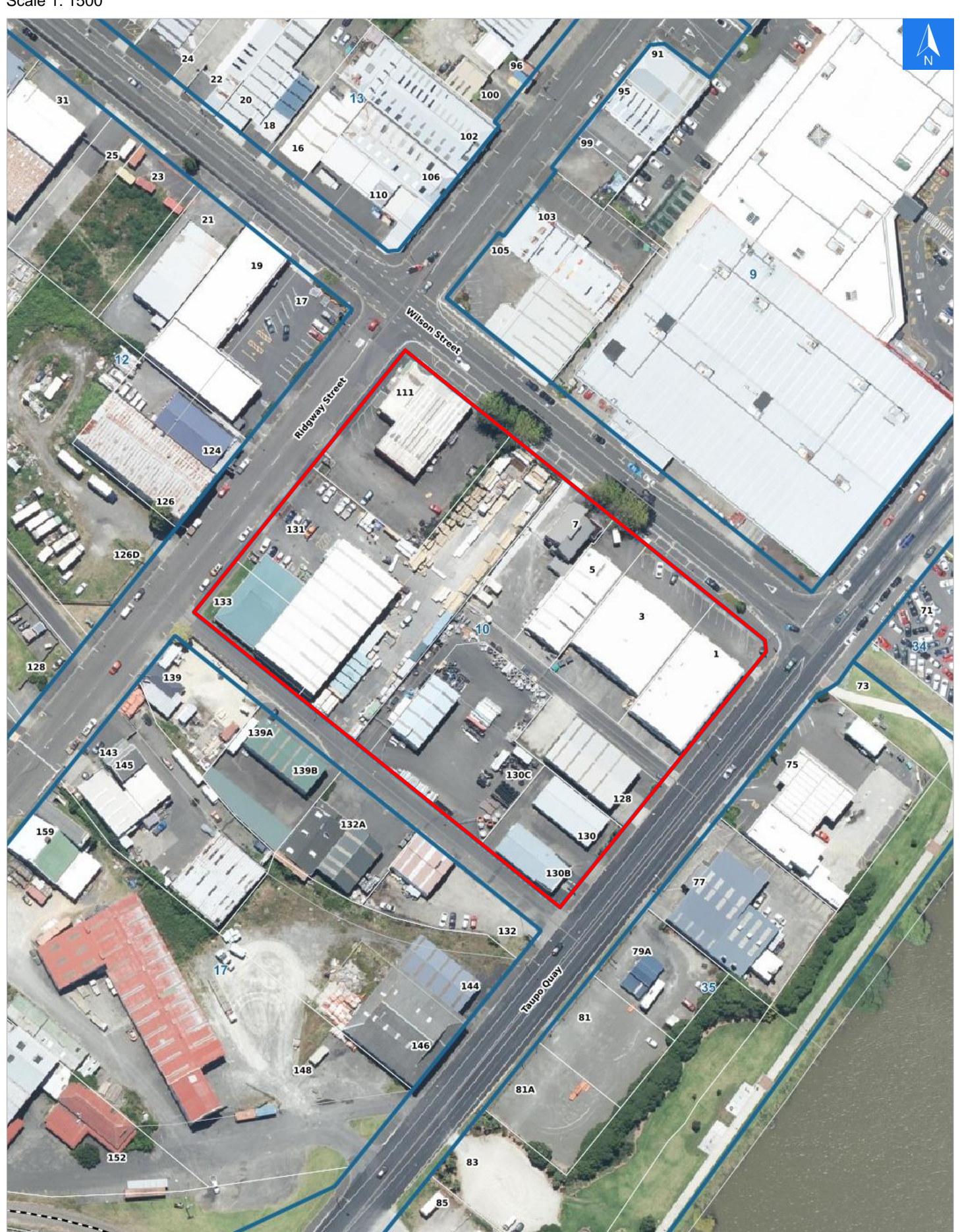
Scale 1: 1500

Digital map data sourced from Land Information New Zealand CROWN COPYRIGHT RESERVED. The information displayed in the GIS has been taken from Whanganui District Council's databases and maps. It is made available in good faith but its accuracy or completeness is not guaranteed. If the information is relied on in support of a resource consent it should be verified independently.