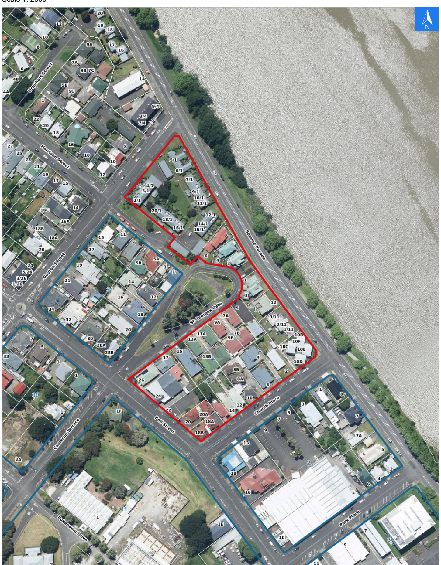
Scale 1: 2000

Digital map data sourced from Land Information New Zealand CROWN COPYRIGHT RESERVED. The information displayed in the GIS has been taken from Whanganui District Council's databases and maps. It is made available in good faith but its accuracy or completeness is not guaranteed. If the information is relied on in support of a resource consent it should be verified independently.