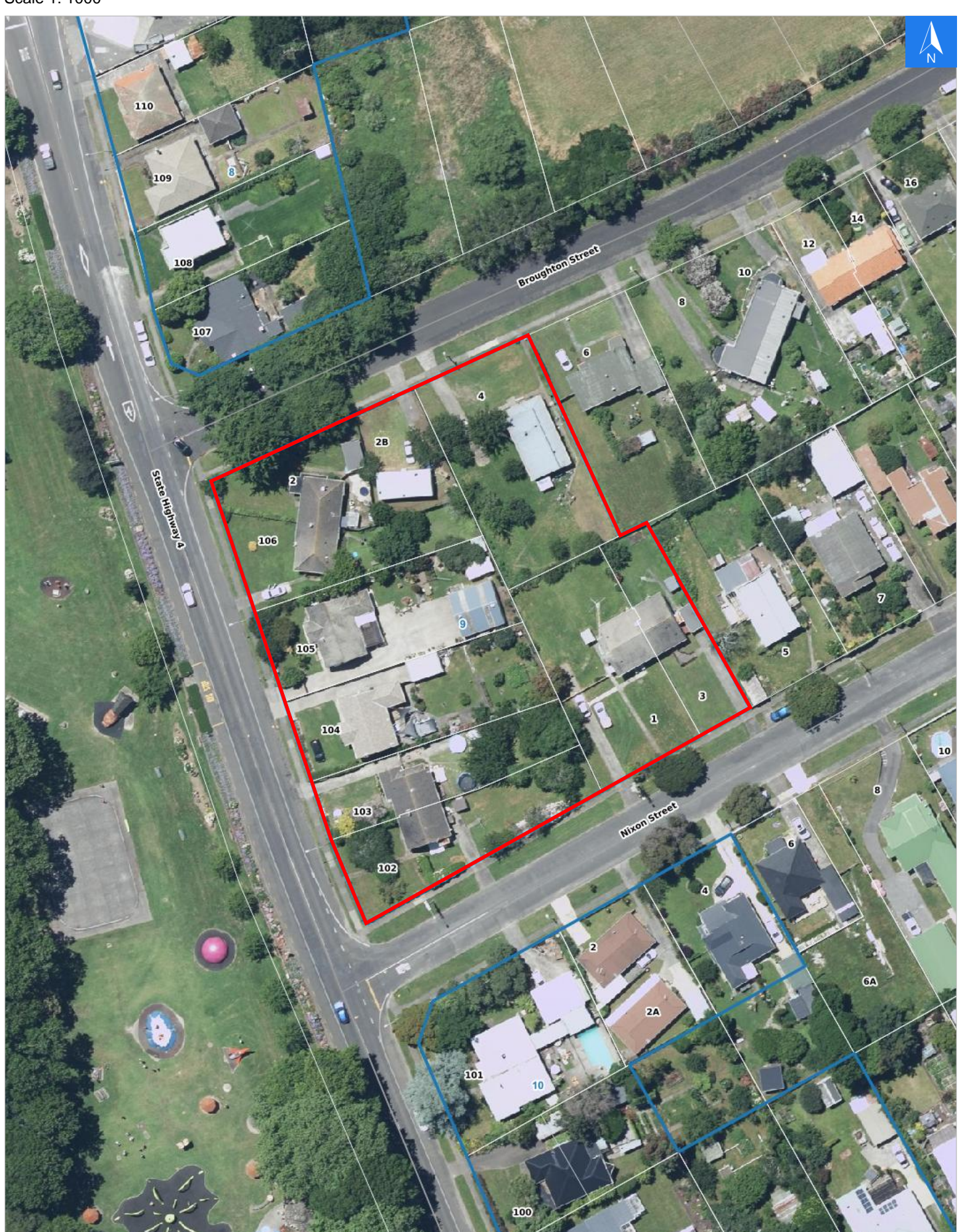
Scale 1: 1000

Digital map data sourced from Land Information New Zealand CROWN COPYRIGHT RESERVED. The information displayed in the GIS has been taken from Whanganui District Council's databases and maps. It is made available in good faith but its accuracy or completeness is not guaranteed. If the information is relied on in support of a resource consent it should be verified independently.