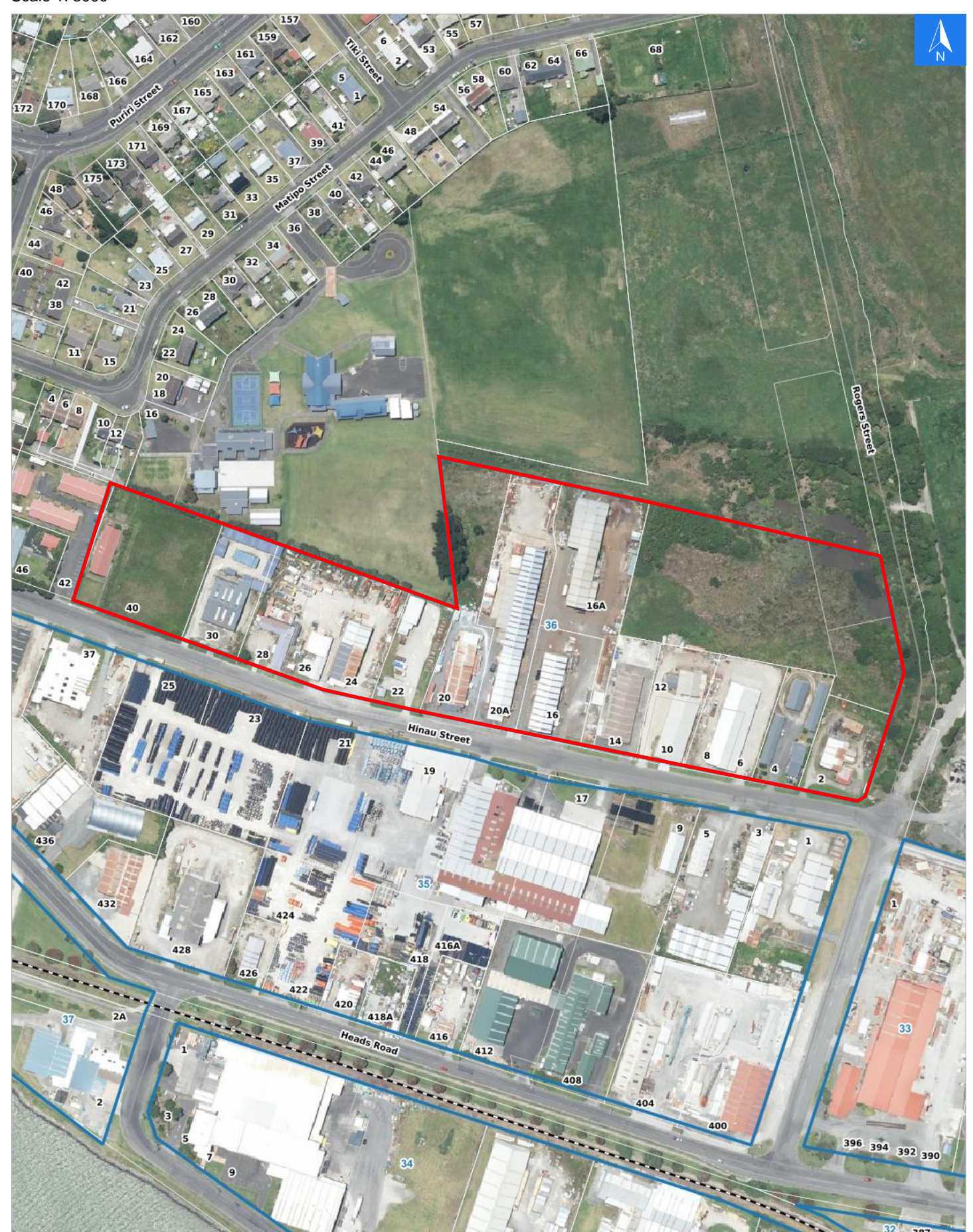
Scale 1: 3000