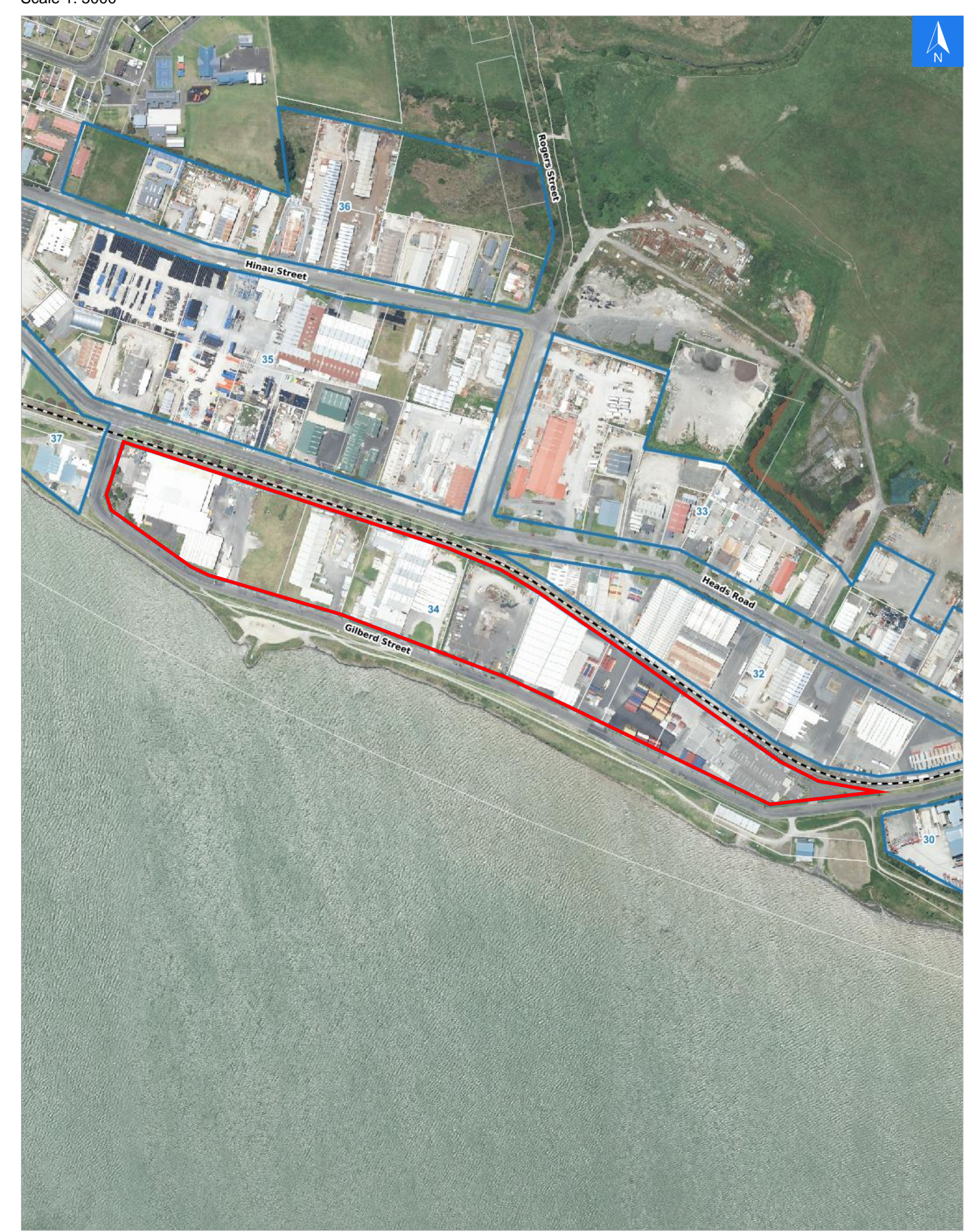
Scale 1: 5000