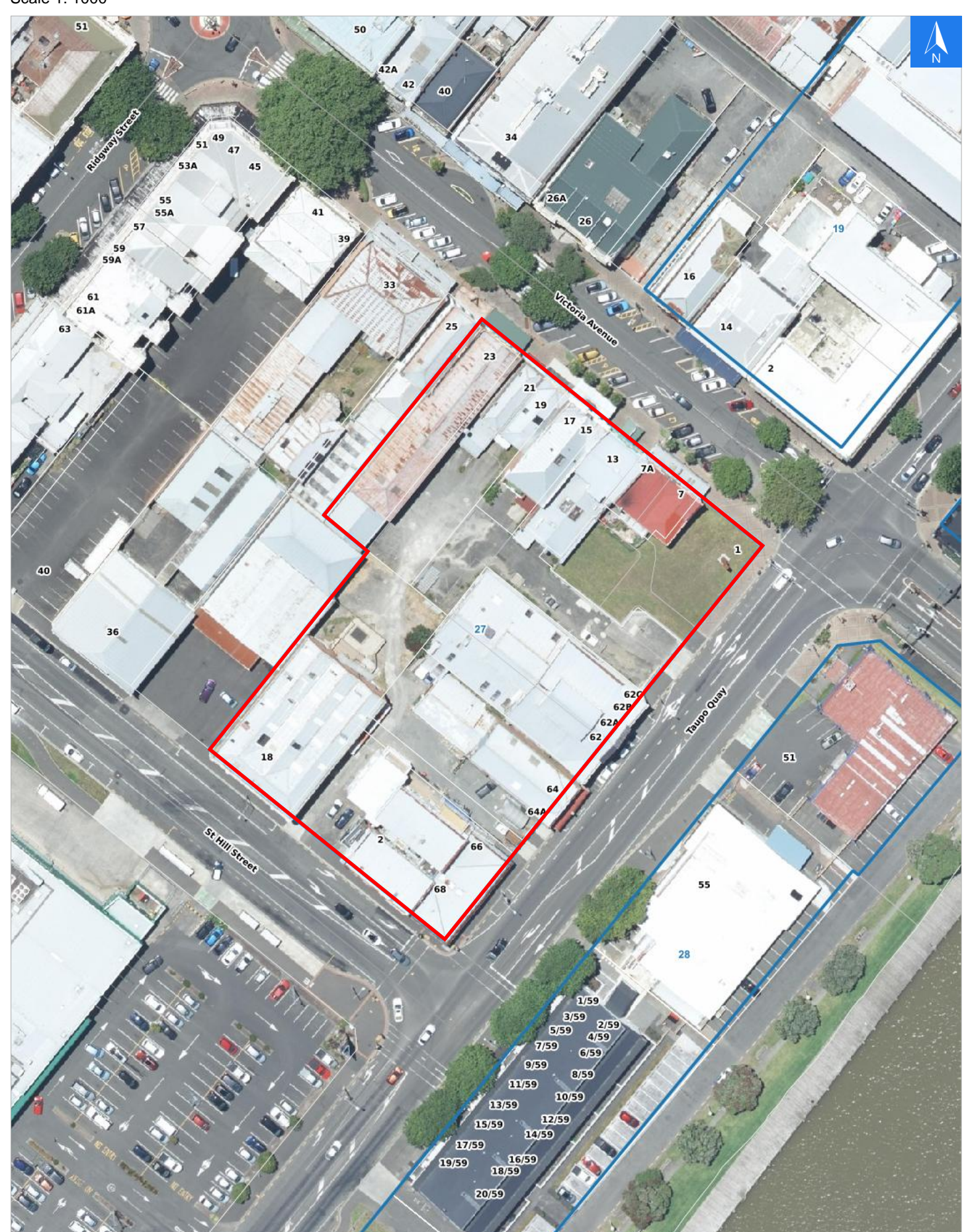
Scale 1: 1000