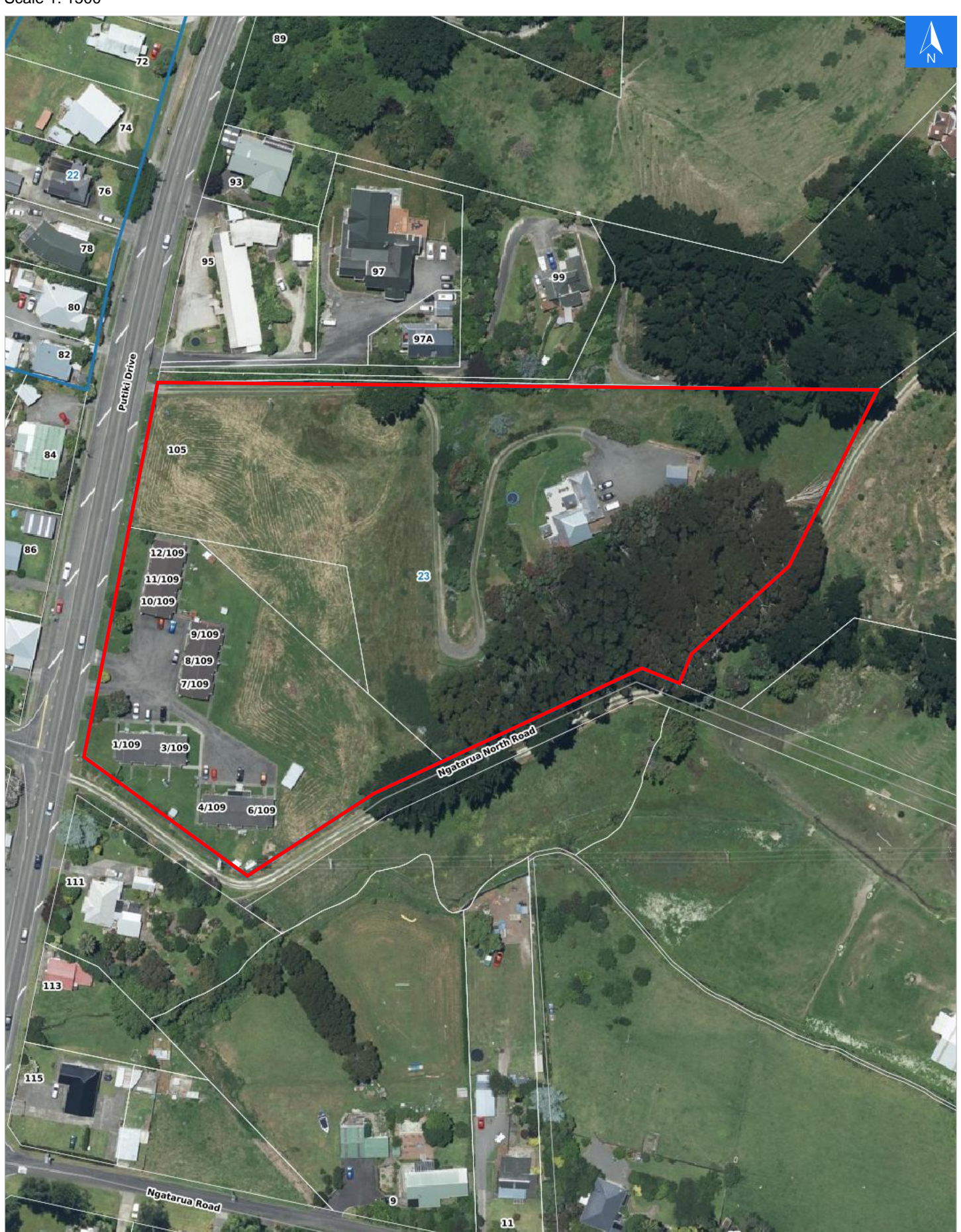
Scale 1: 1500