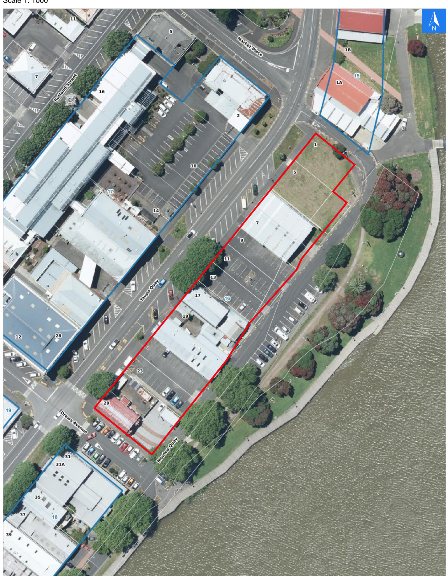
Scale 1: 1000

Digital map data sourced from Land Information New Zealand CROWN COPYRIGHT RESERVED. The information displayed in the GIS has been taken from Whanganui District Council's databases and maps. It is made available in good faith but its accuracy or completeness is not guaranteed. If the information is relied on in support of a resource consent it should be verified independently.