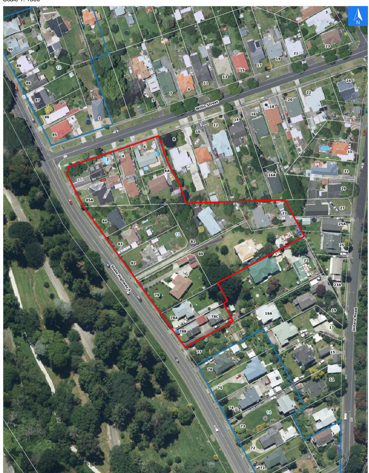
Scale 1: 1500